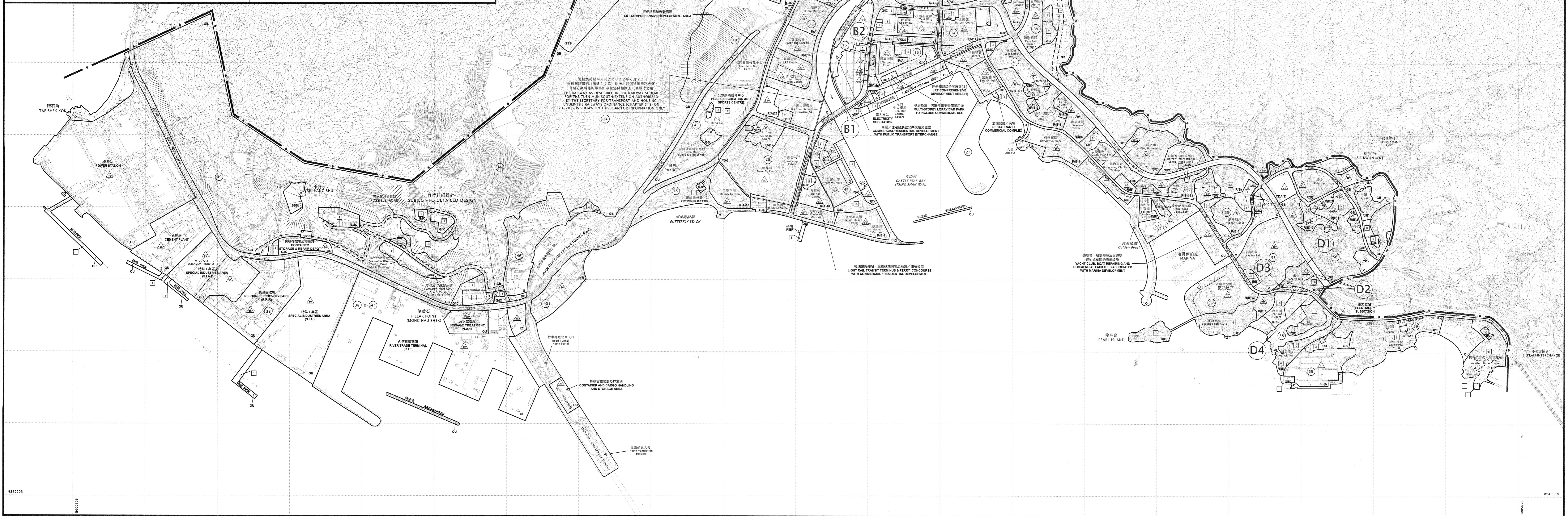
香港城市規劃委員會依據城市規劃條例擬備的屯門分區計劃大綱圖 TOWN PLANNING ORDINANCE, HONG KONG TOWN PLANNING BOARD TUEN MUN - OUTLINE ZONING PLAN